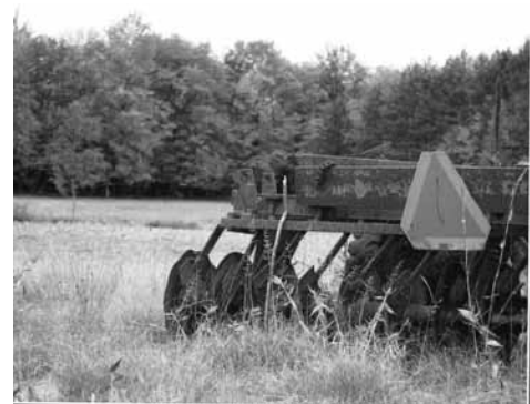
"Fields to Plow" 2nd place Krista Alsworth