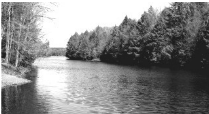
Example of local forest “Whitney Dam”

Your forest is a valuable resource-treat it as such!